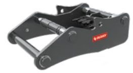
Adapter for suspended work tools